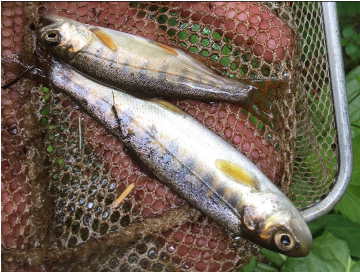
Figure 1.—Juvenile coho salmon captured at waypoint 933.