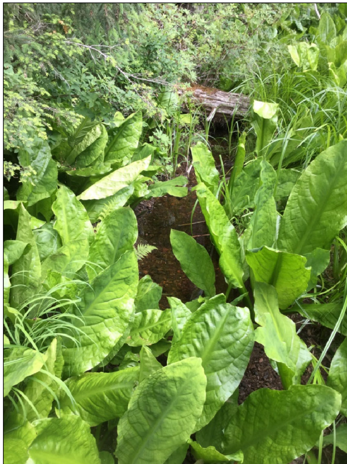
Figure 3.—Channel at waypoint 930.