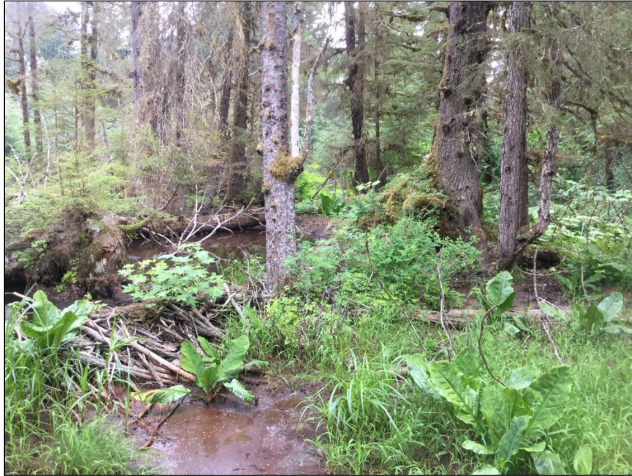
Figure 2.—Complex of beaver dams at waypoint 933.